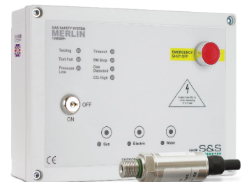
TRIPLE OUTPUT UTILITY CONTROL & GAS PRESSURE PROVING