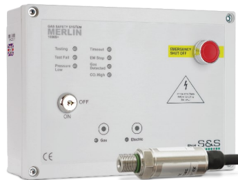
DUAL OUTPUT UTILITY CONTROL & GAS PRESSURE PROVING