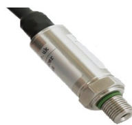
Gas Pressure Transmitter

The Merlin range of gas pressure proving panels will check for any leaks on the pipework or benches at start-up, along with low pressure and over pressure shut off.