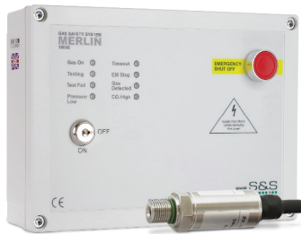
SINGLE OUTPUT UTILITY CONTROL & GAS PRESSURE PROVING